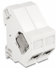
Anwendungsbeispiel mit Stecker